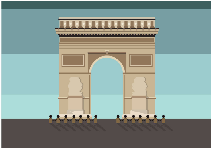
Arc de Triomphe France